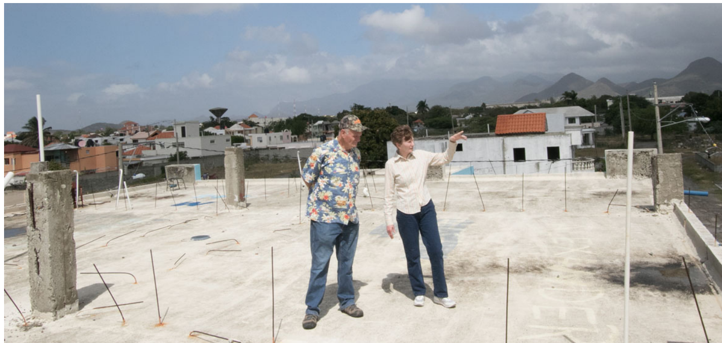
February 2016 Bañí