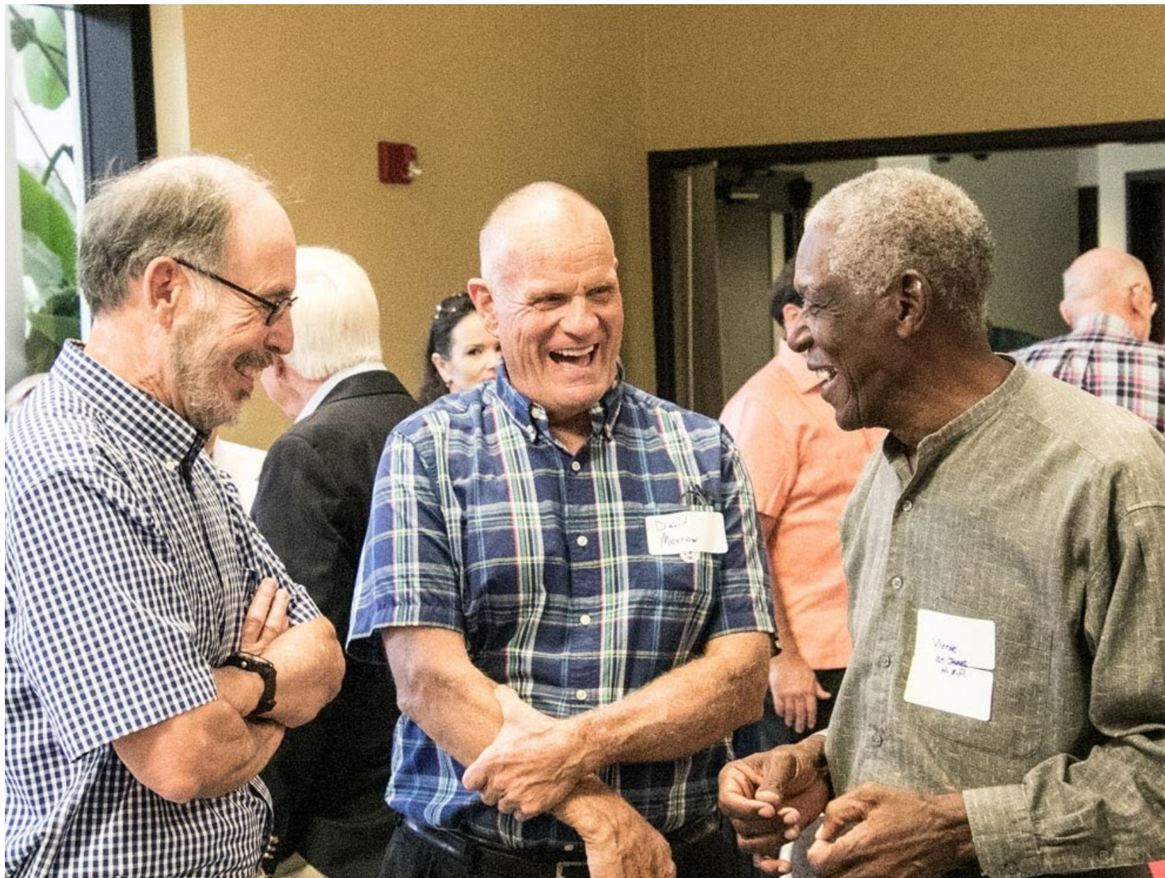
October 2018 Tampa, Florida