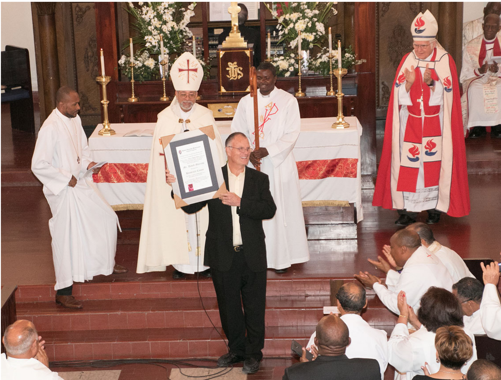
February 2016 Santo Domingo, Dominican Republic