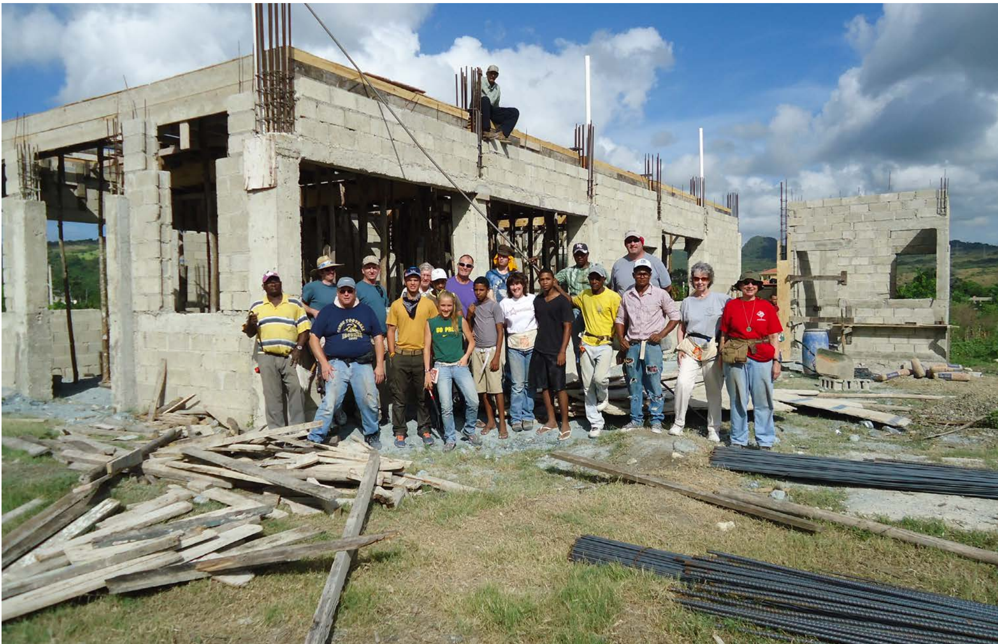
June 2012 Puerto Plata