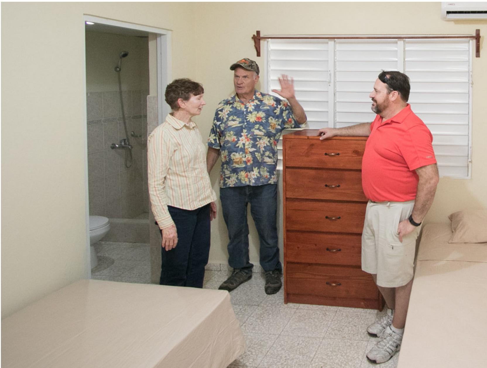
February 2016 Santana, Baní