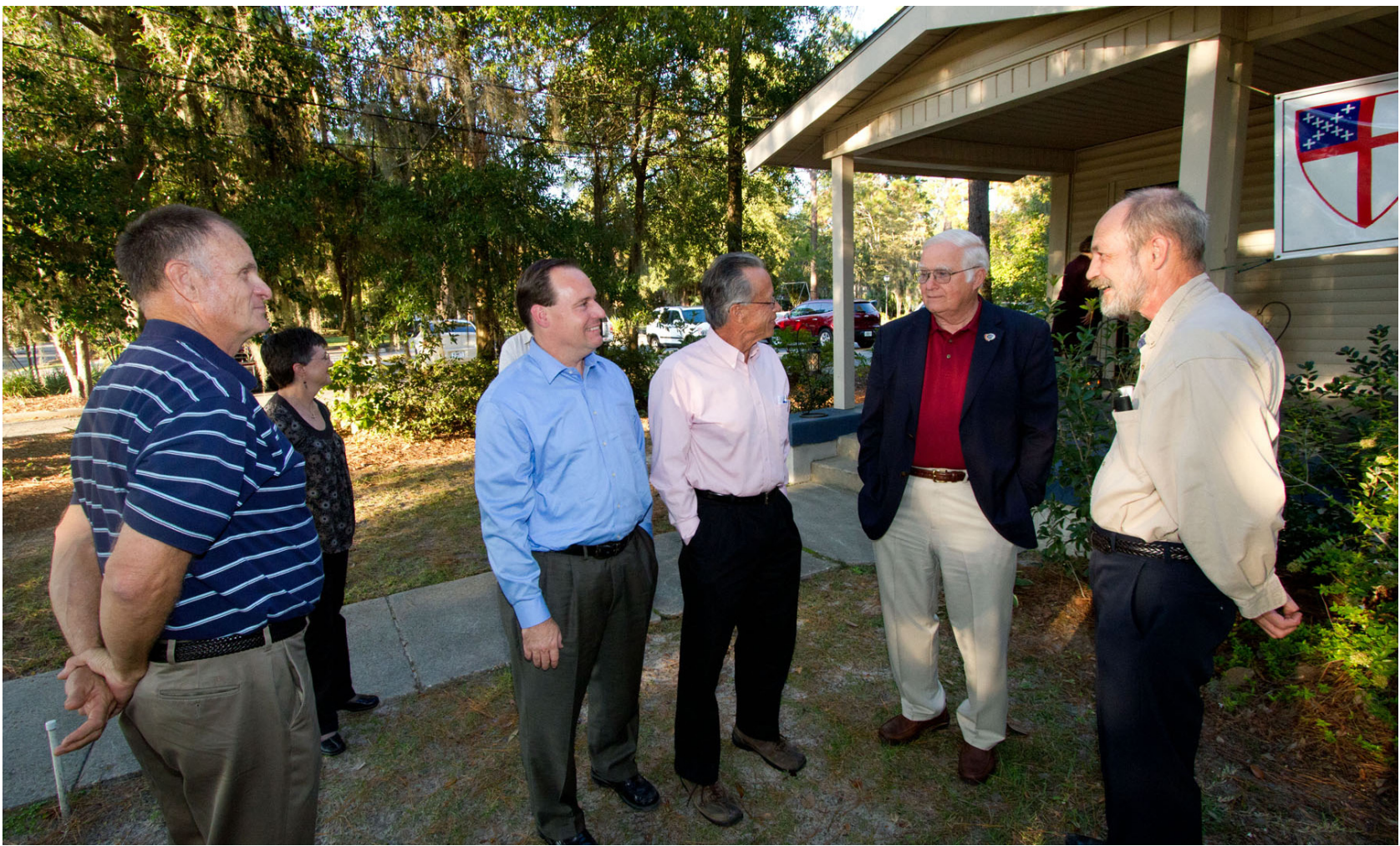
October 2011 Valdosta, Georgia