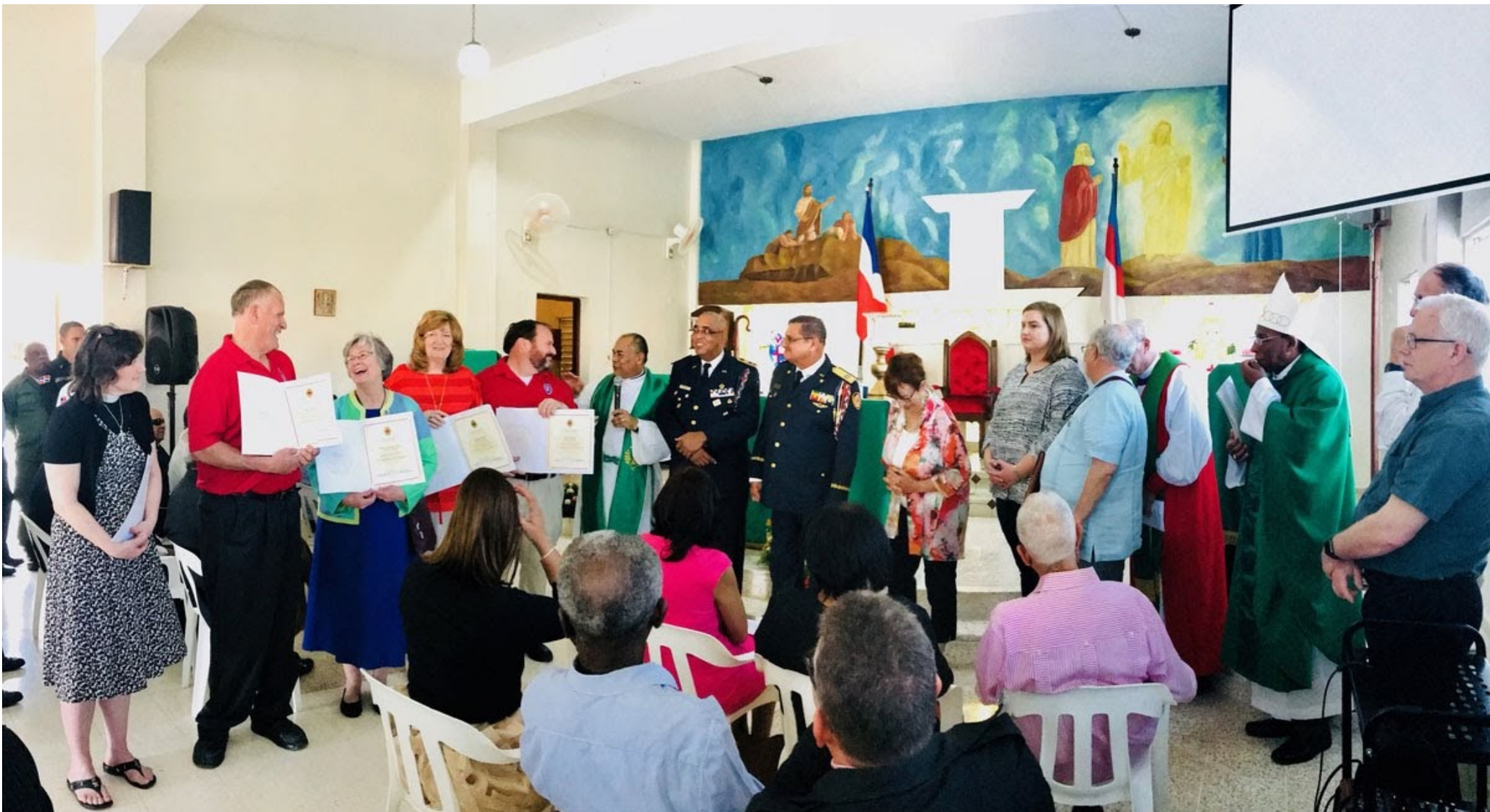
February 2018 Bani