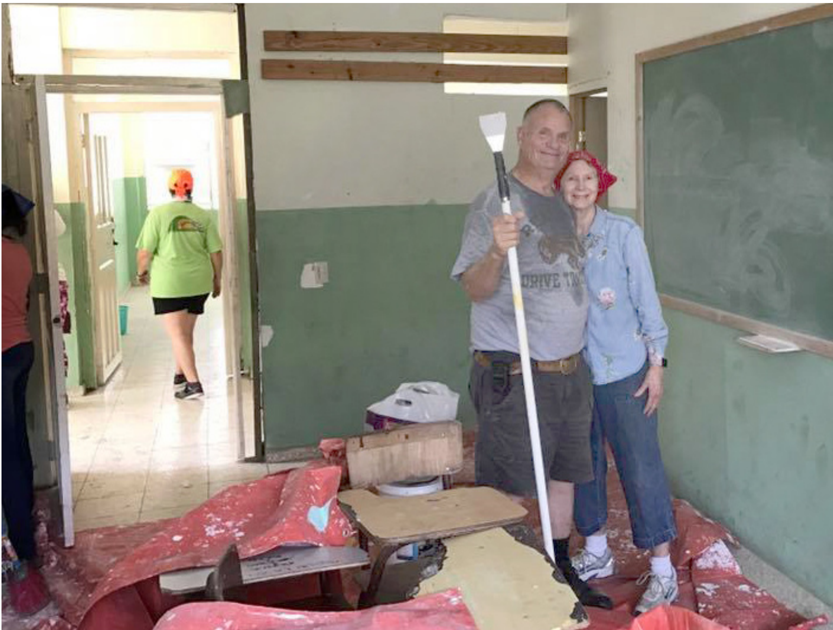
June 2017 Santana, Baní