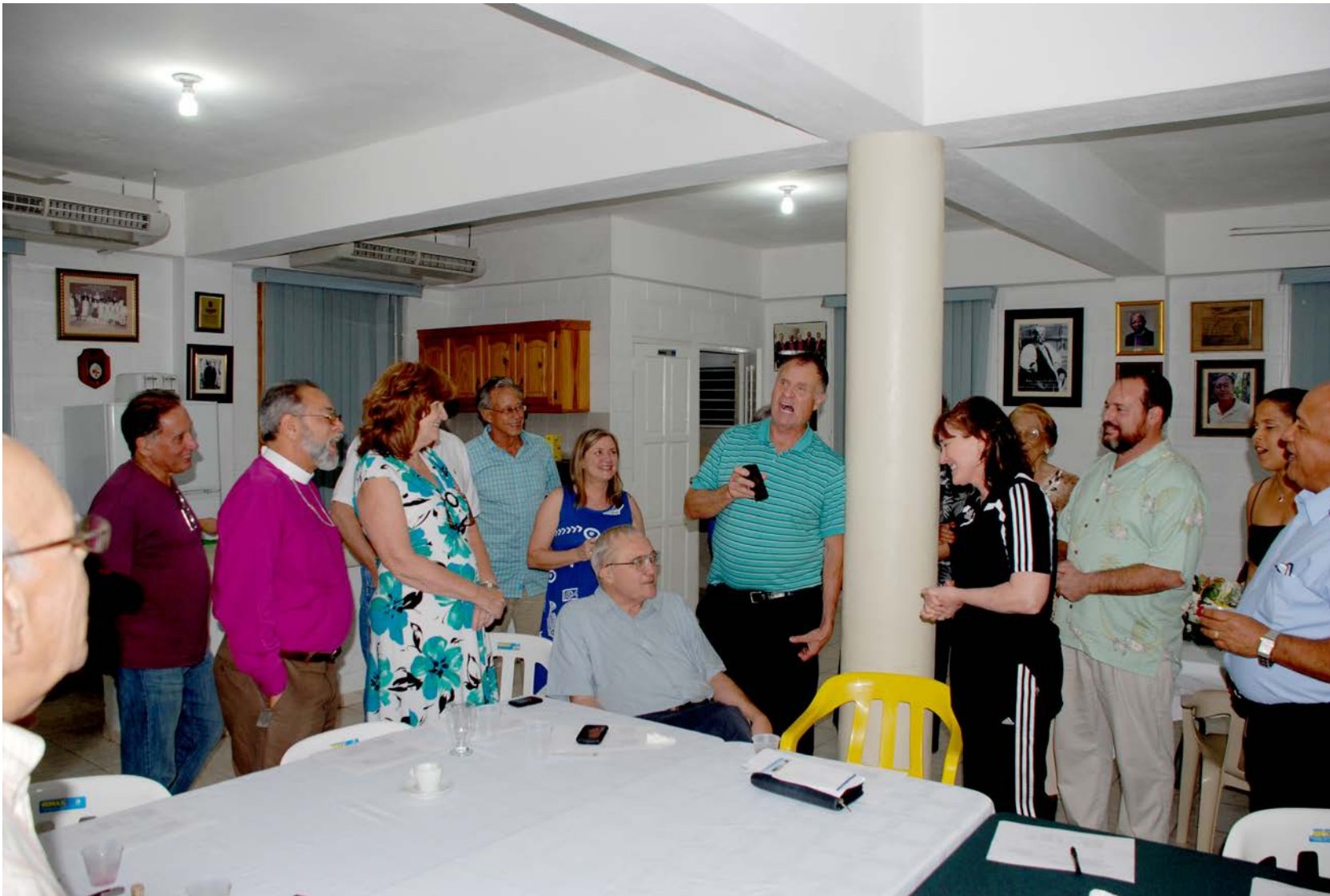
February 2013 Santo Domingo