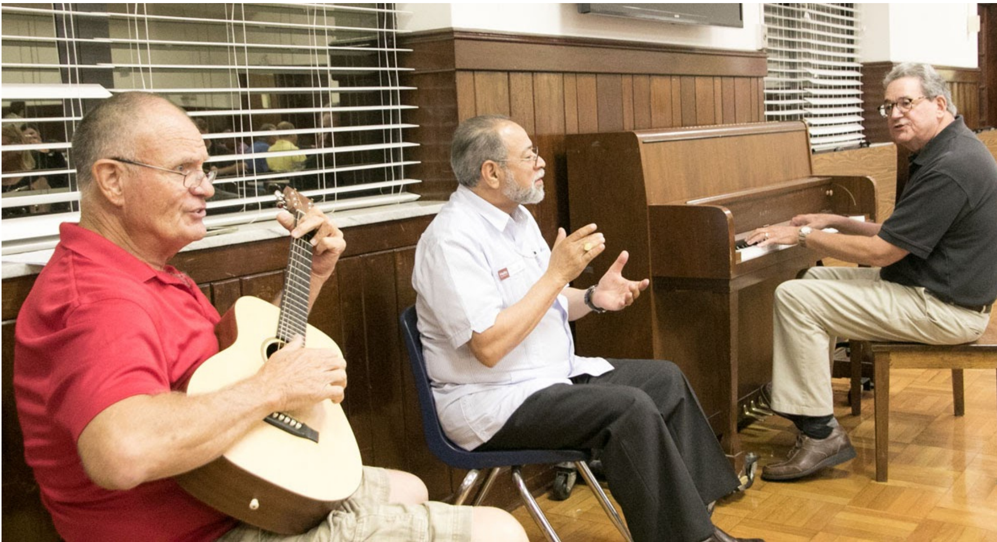
October 2016 Tampa, Florida