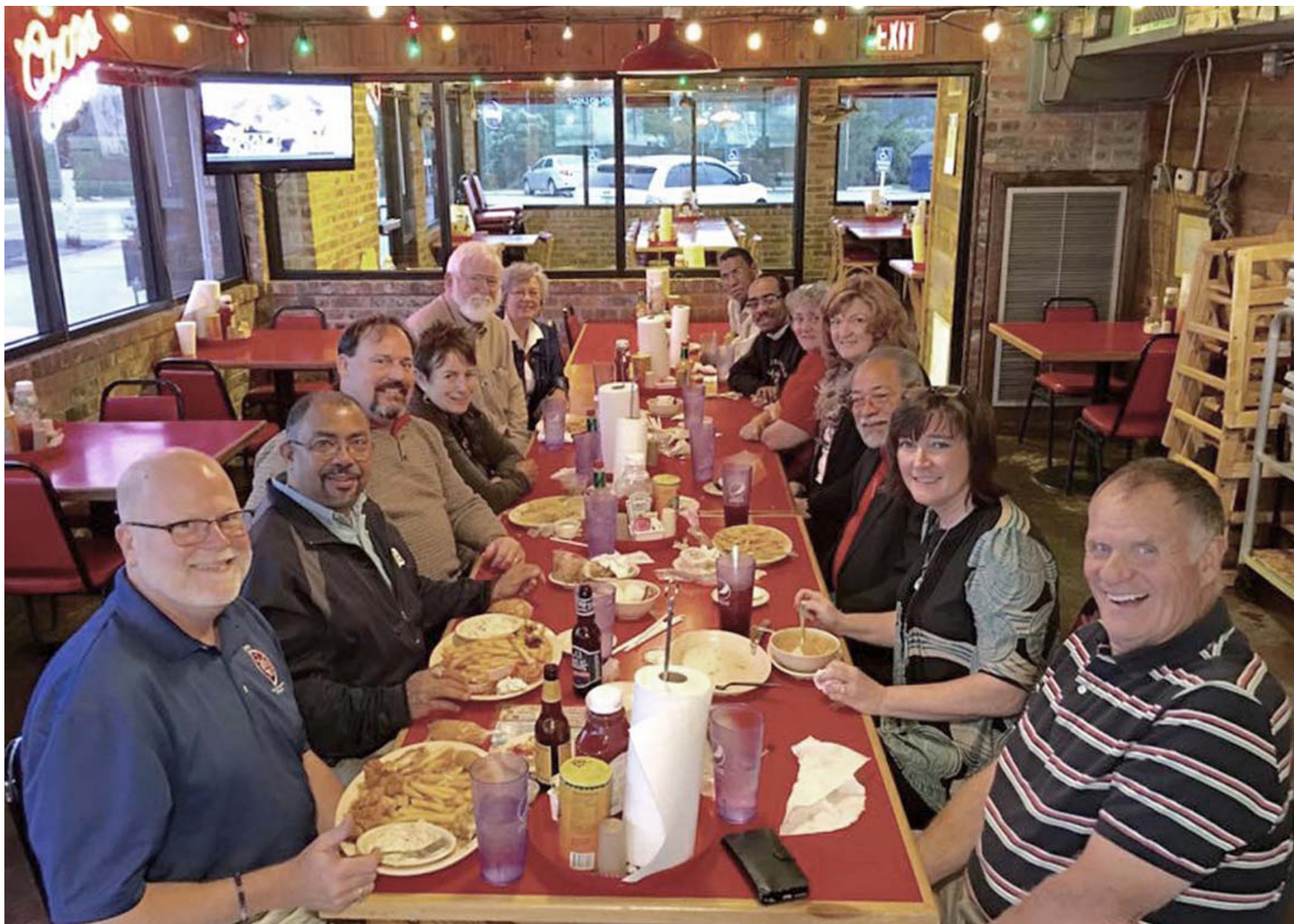
October 2015 Lake Charles, Louisiana