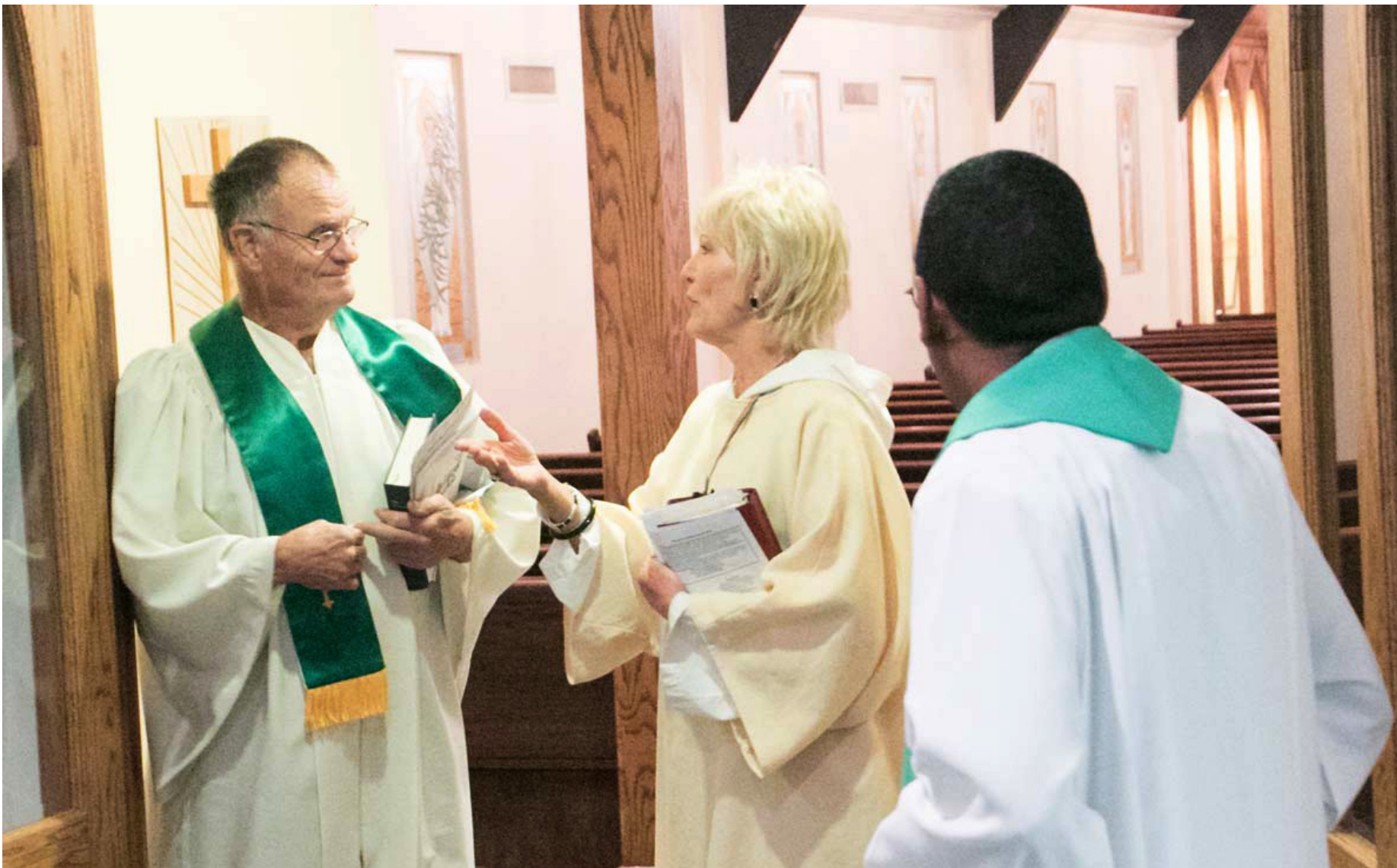
October 2015 Lake Charles, Louisiana