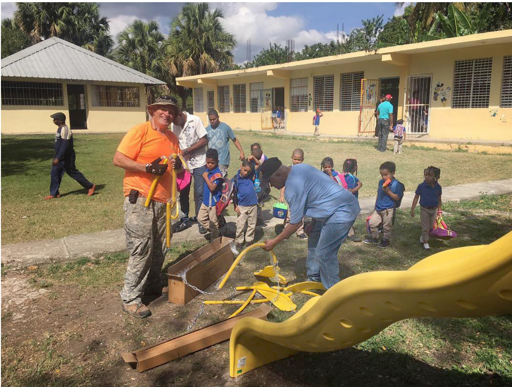
February 2017 Santana, Baní