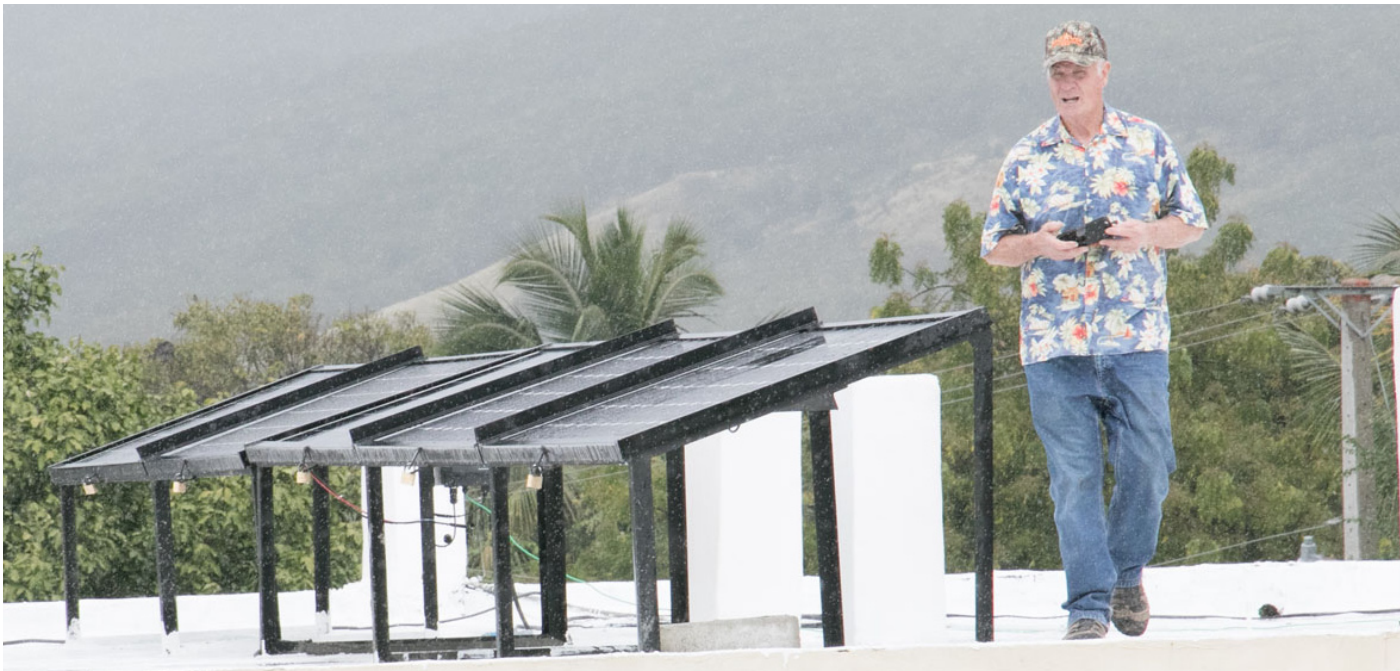
February 2016 Las Carreras