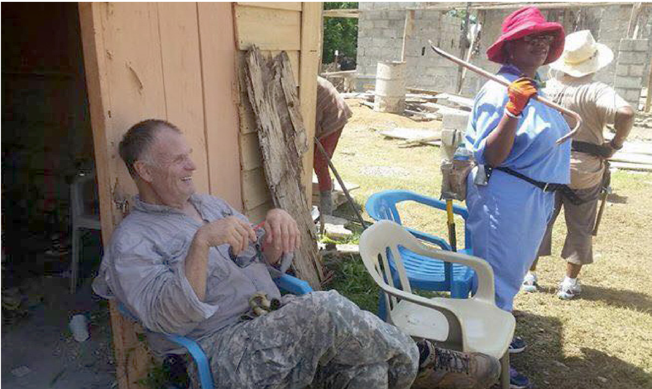
June 2017 Nizao