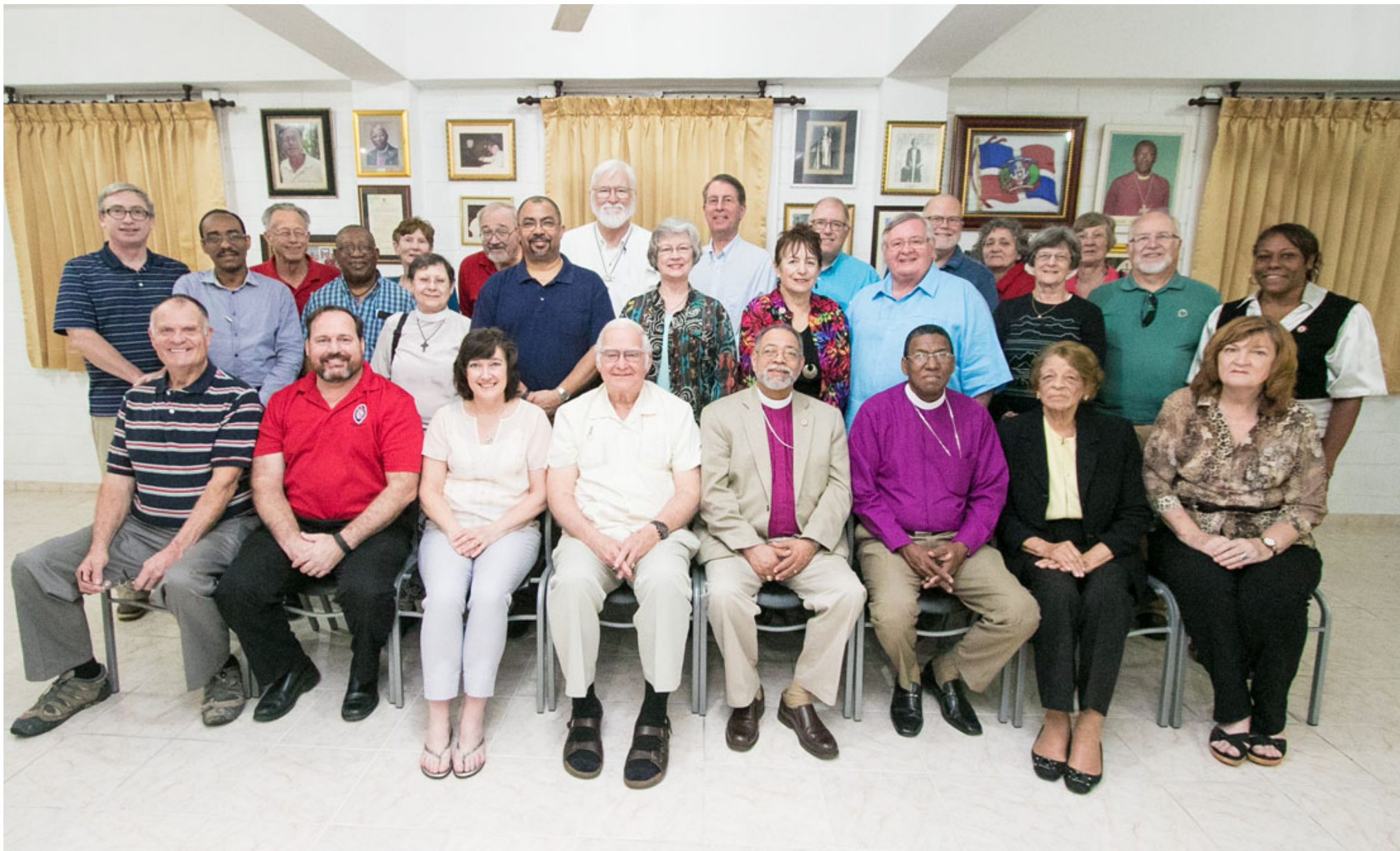
February 2016 Santo Domingo