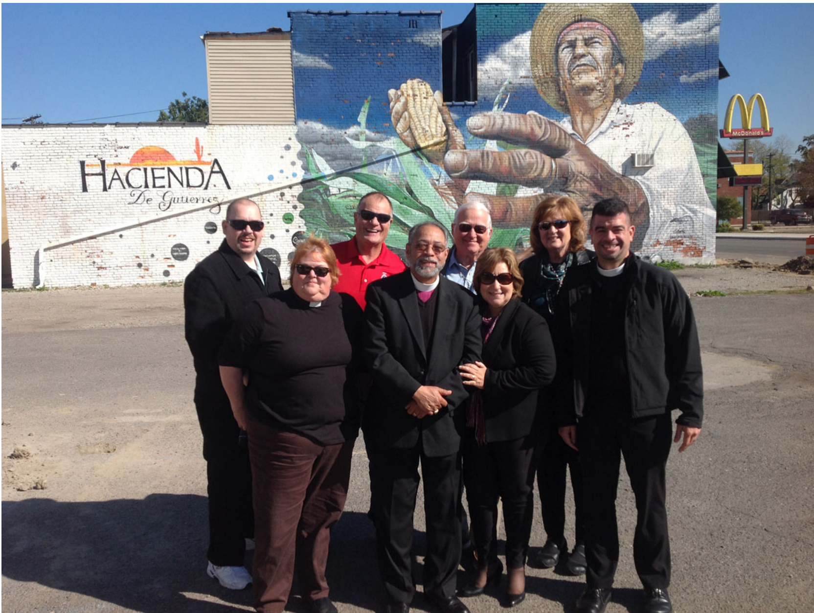
October 2014 Detroit, Michigan