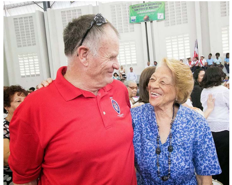
February 2015 San Pedro de Macorís