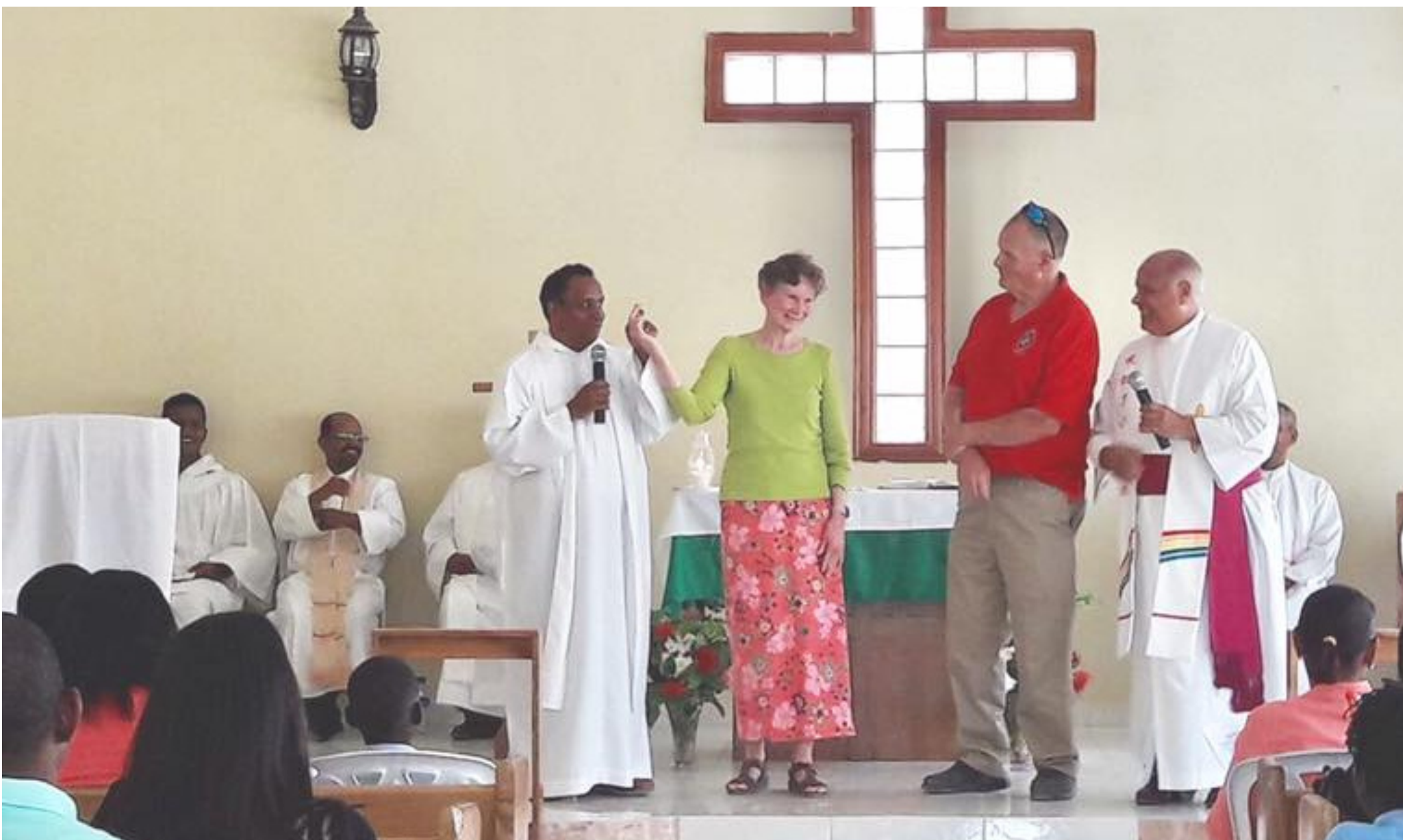
June 2017 Jimaní