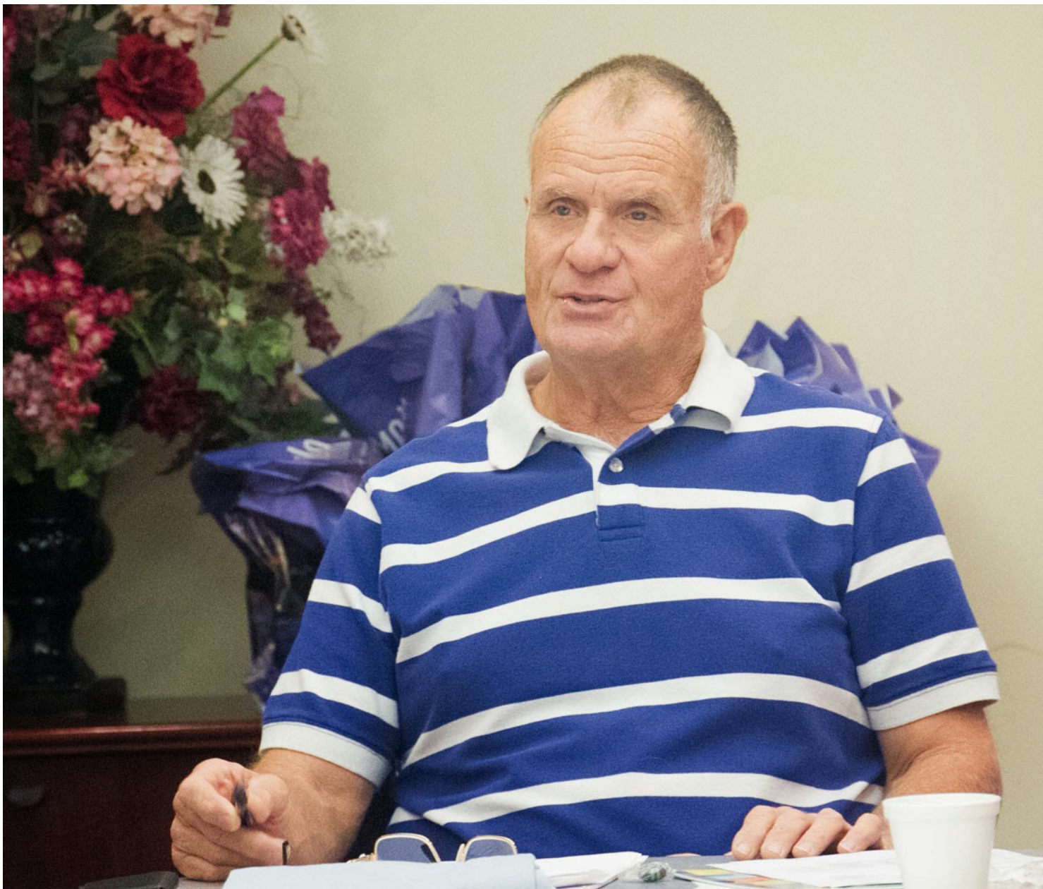
October 2013 Omaha, Nebraska