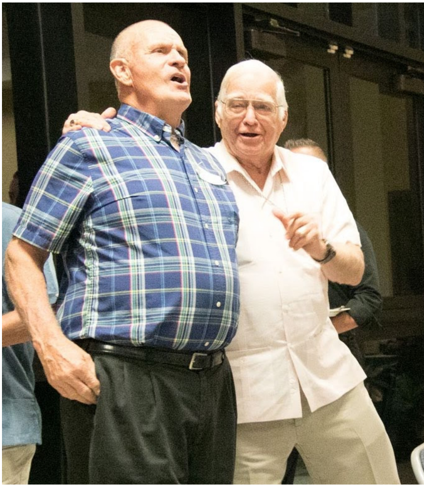
October 2018 Tampa, Florida